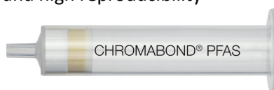
SPE column, CHROMABOND® PFAS

These allow outstanding recovery rates and high reproducibility