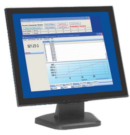
Available as a download